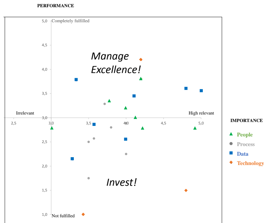
Figure 1. Fulfillment-Importance Matrix at the Case-Study Bank

as overarching questions, and discussing our results with the head of the strategy department. Our first result was that the bank did well in a few central topics of the company-wide adoption of BDA, since many fields of action were located in the “Manage Excellence!” quadrant. For example, the bank made an effort to establish a data quality awareness within regulatory-driven projects. Most interestingly, the fields of action located in the “Invest!” quadrant were distributed almost equally across the four BDA capabilities. Therefore, deriving a BDA roadmap as a purely IT-driven effort would have neglected a substantial share of the relevant gaps. The gap analysis revealed that the first step was laying the foundations for an IDO by, for example, establishing a team of specialists, introducing an explicit research environment, and adopting basic technologies. On this basis, the bank could then begin with the more culture-oriented shift toward an IDO by focusing on generating innovative ideas, agility, and speed when it comes to the implementation of ideas.